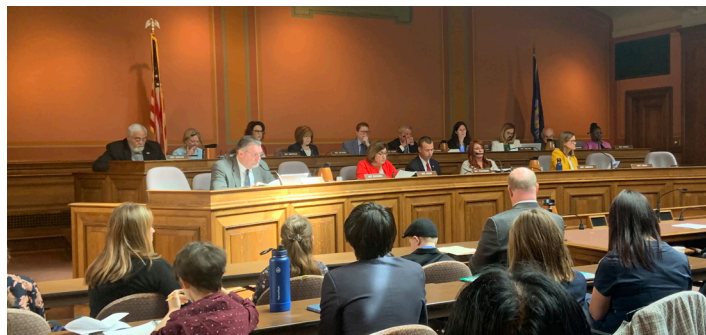
WCRIS staff testify before the Assembly Education Committee at the Wisconsin State Capitol in May.

Beginning in the 2024-25 school year, the act overhauls K-3 reading instruction in choice, charter and public schools. It promotes phonics; prohibits "3-cueing;" forces