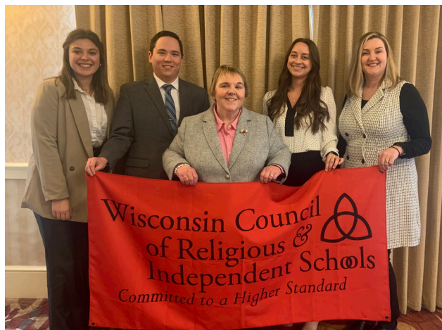
WCRIS staff downtown Madison in March 2023.

All of the WCRIS staff are products of, have children attending and/or spouses working at private schools around the country, from Wisconsin to Arizona, Indiana to Texas. Our staff truly “gets” private schools and their missions.