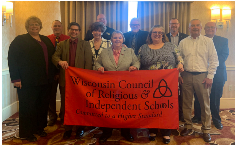
WCRIS Board members and Executive Director at their quarterly meeting downtown Madison on March 21, 2023.

Thank you for supporting our organization, and most importantly, thank you for all you do for your students, staff and communities. We look forward to serving you for the next 50 years!