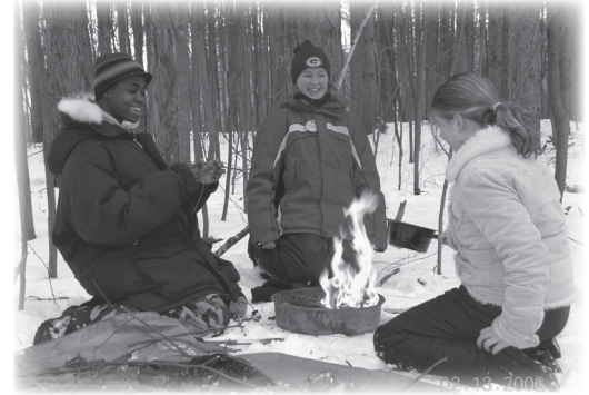
Overnight School Programs

From atop a pine covered ridge 18 miles east of Stevens Point, the Central Wisconsin Environmental Station looks out over clear, deep Sunset Lake. The Station is operated year round by professional natural resource staff and undergraduate and graduate students from UW-Stevens Point. We offer both day and overnight school programs, summer camps, meeting space, cabin and lodge rentals, food service, and team building retreats.