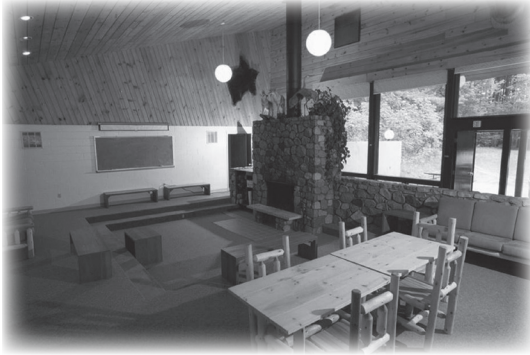
Weekend cabin and lodge rentals